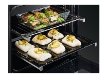
Hot Air. For fast, even cooking every time

The Hot Air fan circulates the temperature evenly, creating the ideal conditions for baking. As a result, you achieve perfect results whatever you're making.