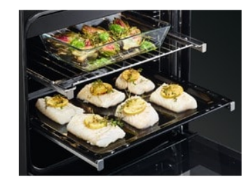
Hot Air. For fast, even cooking every time

The Hot Air fan circulates the temperature evenly, creating the ideal conditions for baking. As a result, you achieve perfect results whatever you're making.